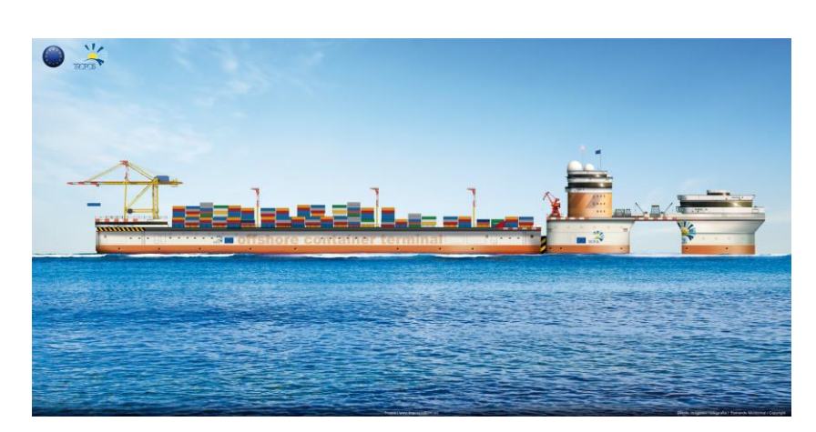
Offshore Container Terminal – Conceptual design

Fresh water is generated by a desalination unit for all five TROPOS scenarios. Waste water is filtered and purified in a septic plant before being discharged. In case of the Leisure Island scenario, sewage will be transported to the shore as no discharge is allowed in the area. Solid waste is treated on board the central unit following best practice, including compacting, high quality incinerator and subsequent transport to shore (D3.5).