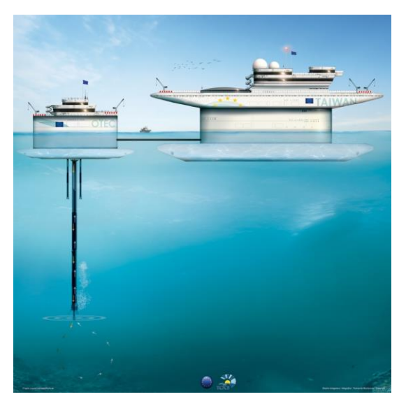
Green & Blue Taiwan - Conceptual design

Green & Blue, Taiwan. In this scenario, located southwest of Taiwan close to Liuqiu Island, fish and macroalgae aquaculture are combined with a floating Ocean Thermal Energy Conversion (OTEC) for energy supply. The 8 MW OTEC plant, operated as a closed cycle system, uses the ocean's naturally available vertical temperature gradient to produce electrical energy. Beside the type of renewable energy source, another difference to the Green & Blue scenario in Crete is that the Liuqiu Island scenario platform also includes some (limited) leisure facilities, such as cafés, bars, restaurants and observatories for the public, and provides accommodation for visitors.