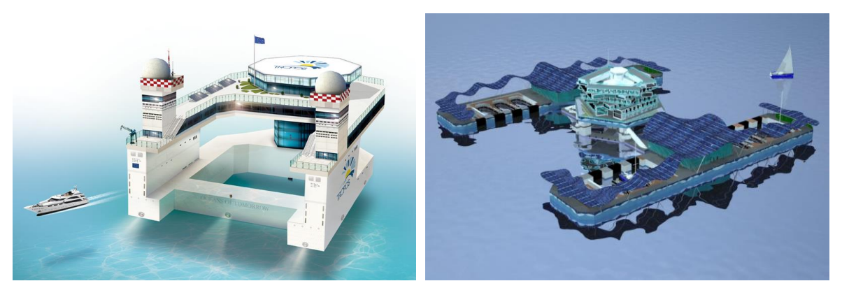
Leisure Island – Conceptual design (left) and Engineering design (right)

• Leisure Island, Gran Canaria. This scenario, located southwest of Gran Canaria Island, involves a multitude of leisure facilities for tourists and local residents, including the full range of hotel services. Energy demand of the platform is partially met by a photovoltaic (PV) plant; as backup additional electricity might be provided via an HVAC cable from land. This scenario does not involve satellites, but several modules integrated into the central unit platform: a visitors' centre, food & beverages, accommodation, monitoring, energy storage, and a marina. Visitors as well as staff are transported via daily shuttle transfers between Gran Canaria and the platform. Visitors can also approach the platform with private yachts by entering the marina.