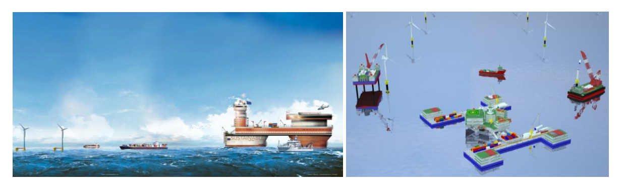
Sustainable Service Hub – Conceptual design (left) and Engineering design (right)

• Sustainable Service Hub, Dogger Bank. This scenario, located in the central North Sea, focuses on transport and energy related needs of the offshore renewable energy sector and serves as an offshore wind hub for a wind farm assembled around the platform. The service hub consists of 4 modules: a quick reaction maintenance base, a substation, and an accommodation module for service staff and a helipad. The electrical energy generated by the wind turbines directly supplies the electrical power consumers of the entire facility. Due to the accommodation infrastructure for the workforces, this concept has capacity to host a large number of people. The infrastructure is also available for external visits (controlled and following strict security measures). The waste heat of the electricity generation is used for heating purposes.